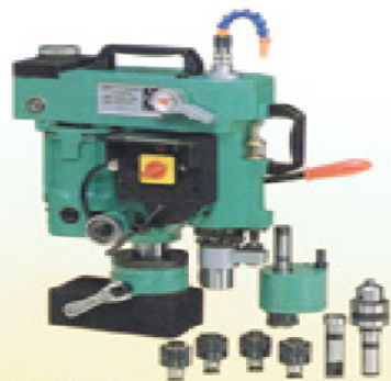
A-22NS Portable Magnetic Drill & Cutting & Tapping Machine