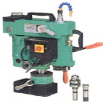
A-22 Portable Magnetic Drill Machine