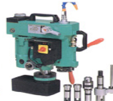
A-25N Portable Magnetic Drill Cutting Machine