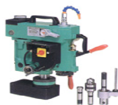
A-22N Portable Magnetic Drill Cutting Machine