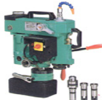
A-25 Portable Magnetic Drill Machine