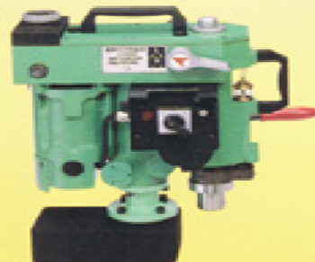
FM-50G Portable Magnetic Cutting Unit