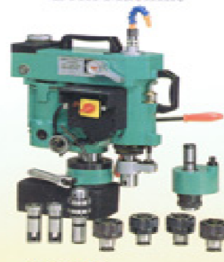
A-25NS Portable Magnetic Drill & Cutting & Tapping Machine