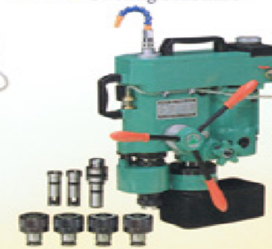
A-25S Portable Magnetic Drill & Tapping Machine